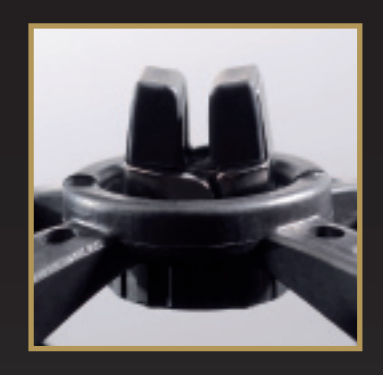
The clamping system, rubber covered to avoid scratching, adjusted by the rotating ring, allows Tetrax® XWAY to be safely fastened on the car air vent.

Tetrax<sup>®</sup> Invisible Attraction, 4 magnets, neodymium alloy, gold coated, create an attraction power equal to 1500 g that resist over 5G of acceleration and hold devices up to 300 g in weight (a portable navigation system weight is usually around 200 g).