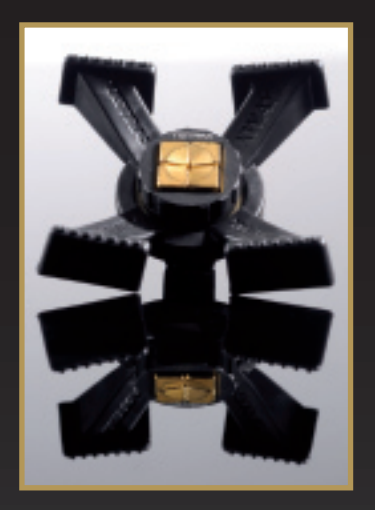
The X thermoplastic rubber structure fits perfectly the different model shapes available in the market in order to guarantee stability and easiness of operating.

A patented system, made in Italy, to hold practically, safely and in stable condition GPS navigation system and smart phones.